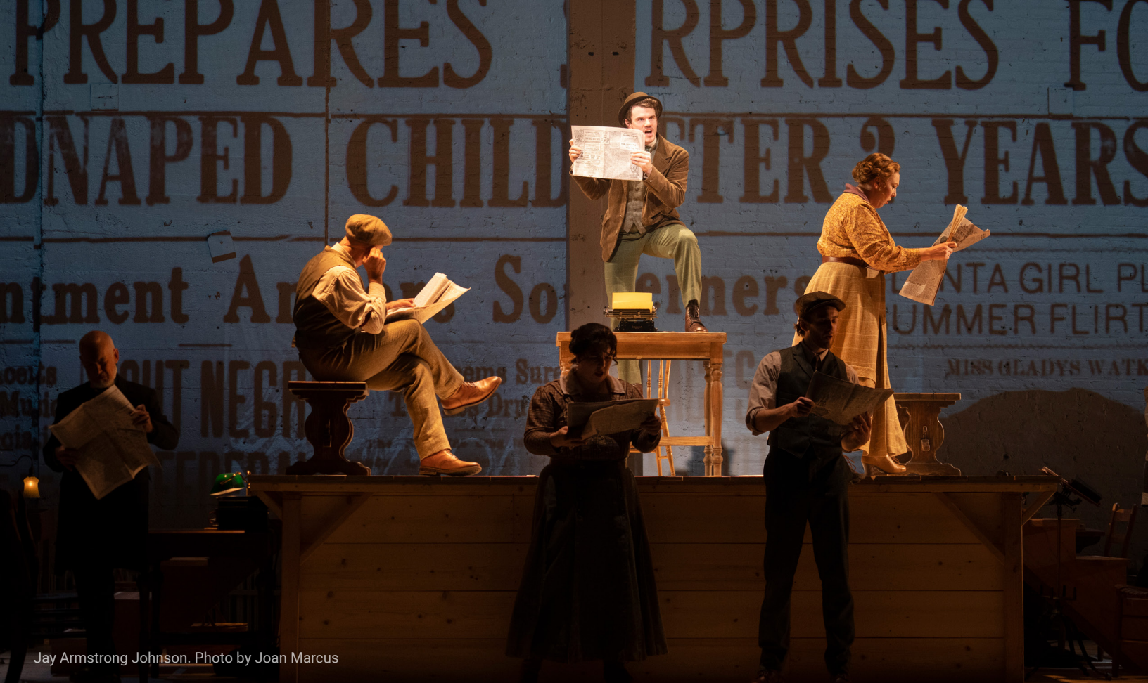
Jay Armstrong Johnson.