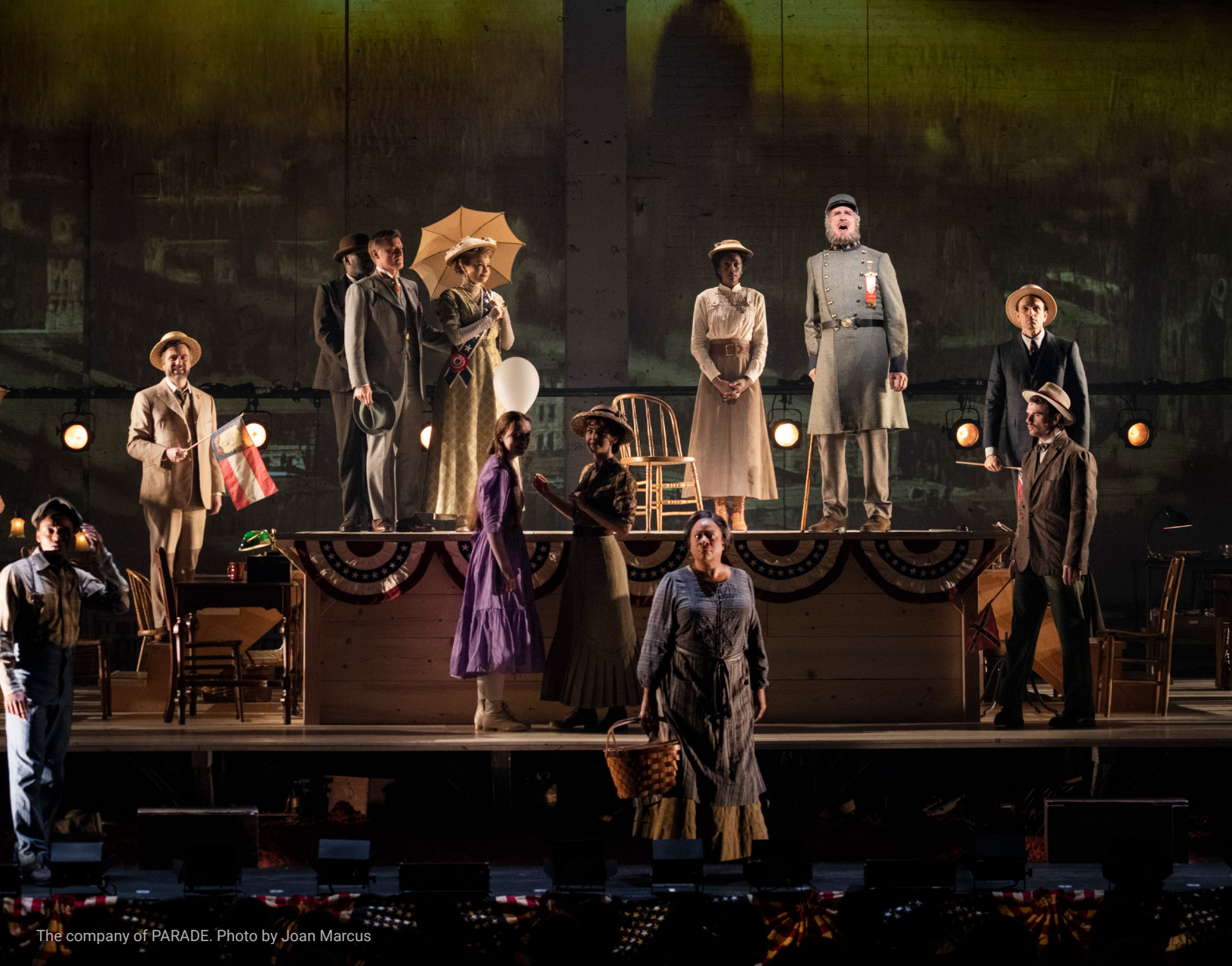
The company of PARADE.