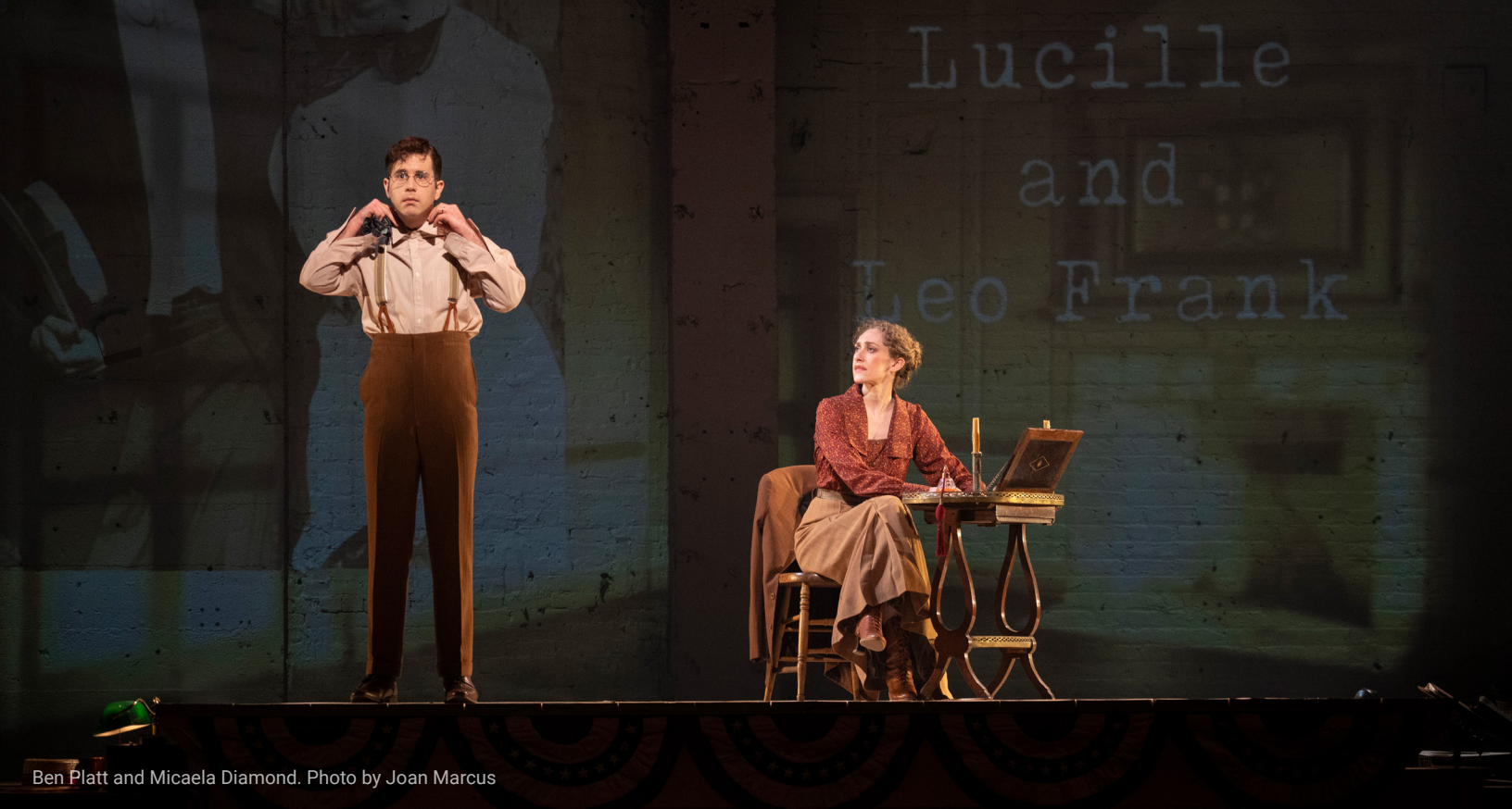
Ben Platt and Micaela Diamond.